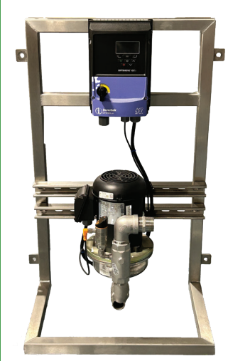
AVAILABLE IN: Simplex - Duplex

Low Flow - Low Boost Strip Malls / Restaurants Multi-Family Housing Small Office Buildings Truck Stops / Car Washes *Impellers are non-trimmable